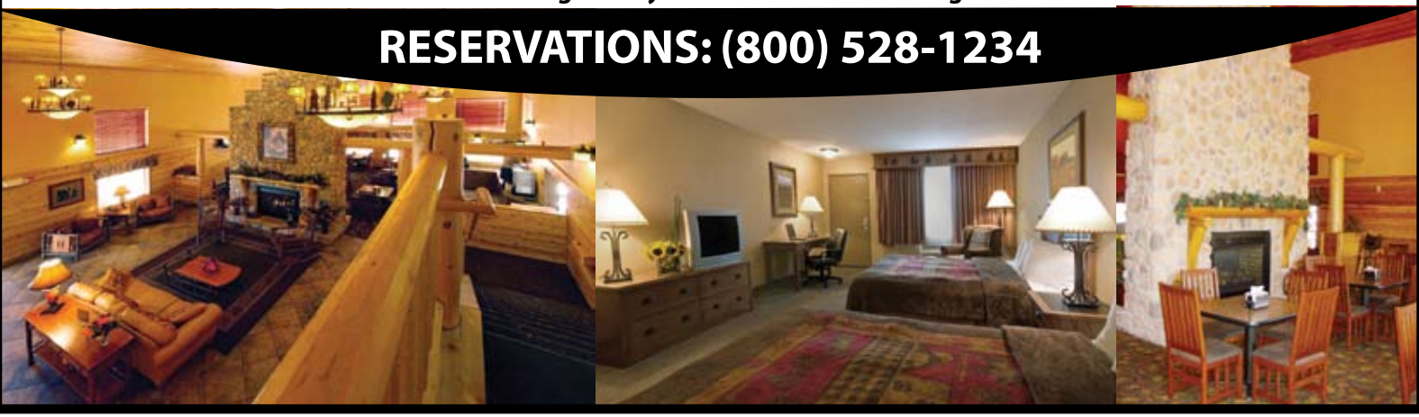
Each Best Western® branded hotel is independently owned and operated.

4915 Southgate Drive • Billings, MT 59101 • 406-256-9400 • Fx 406-256-9405 email: bwbillings@kellyinns.com • www.bwbillings.com